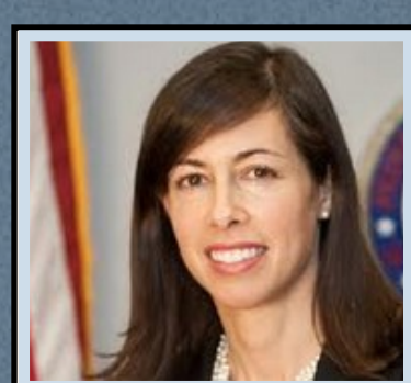
FCC Commissioner Jessica Rosenworcel