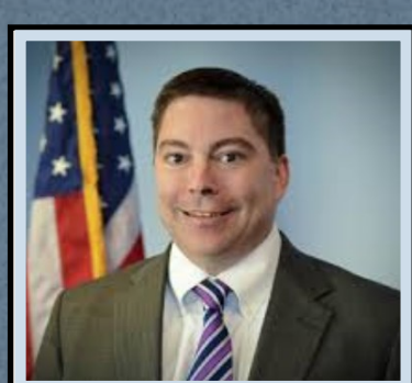
FCC Commissioner Michael O'Rielly