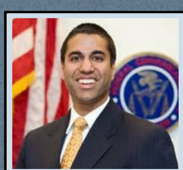
FCC Commissioner Ajit Pai